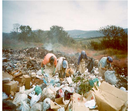
Pickers at a dumpsite

Some of the initial actions developed by the National Forum were: (1) a national mobilization campaign; (2) a pilot programme for the implementation of the first experiences of Municipal Waste & Citizenship Forums in the country and (3) the development of a National Training Programme in Urban Waste Management.